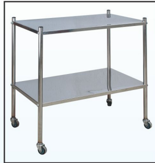
Instrument Trolley MNM-OTE-410