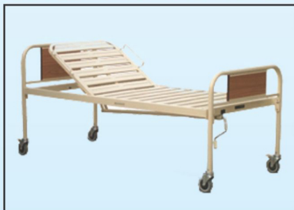
Bed Semi Fowler MNM-HB-15