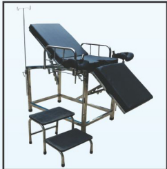
Stainless Steel MNM-GR-510