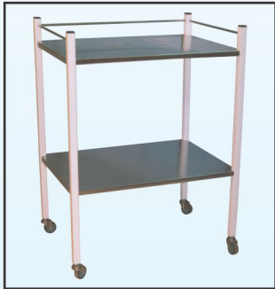
Instrument Trolley MNM-OTE-405