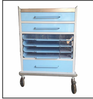
Medicine Cart MNM-WF-350