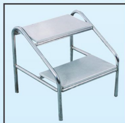
Stainless Steel MNM-WF-720