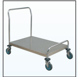
Transport Trolley MNM-HK-805