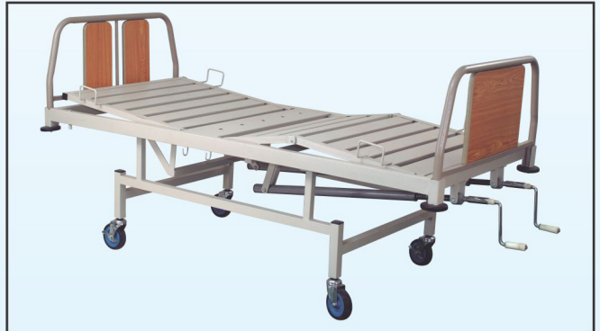
Fowler Bed MNM-HB-60