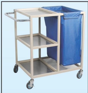
Linen Handling Trolley MNM-HK-350