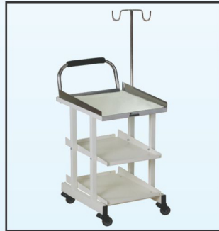
ECG Trolley MNM-WF-705