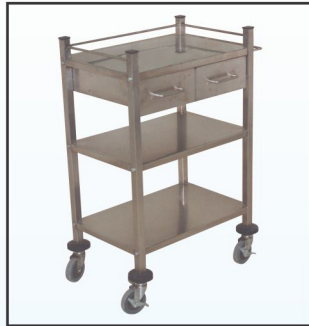
Medicine Trolley MNM-OTE-401