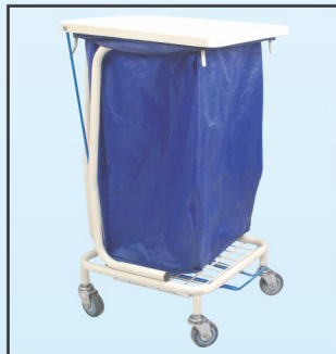
Trolley for solid Linen MNM-HK-360