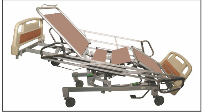
Intensive Care Bed MNM-HB-555