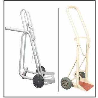
Cylinder Trolley MNM-WF-710 / 700