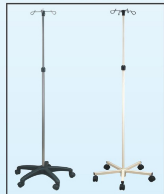
MNM-WF-725 / 730

Block # 4 Rashid Minhas Road, Small Industrial Estate Sialkot 51310 - Pakistan.