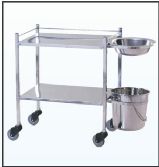
Dressing Trolley MNM-WF-355-S