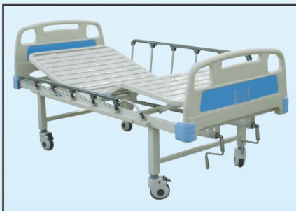
Fowler Bed Deluxe MNM-HB-60-A