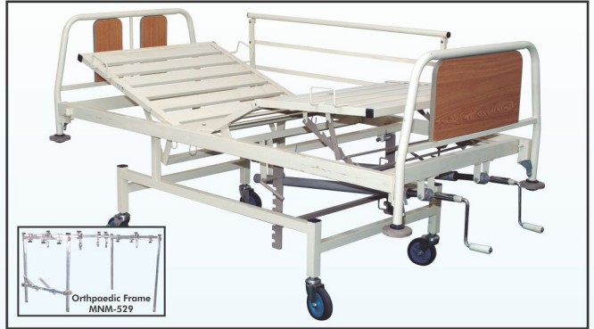
Fowler Tilt Bed MNM-HB-30