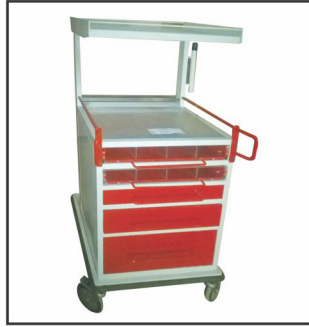
Crash Cart MNM-WF-345-A