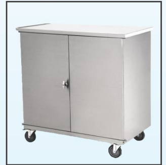
Linen Transport Trolley