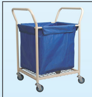
Linen Handling Trolley MNM-HK-370