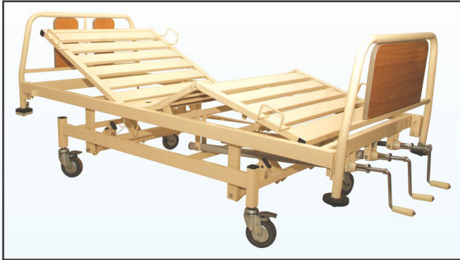
Height adjustable (three crank bed) MNM-HB-70