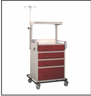
Crash Cart MNM-WF-345