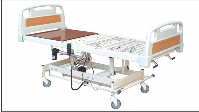
Motorized ICC / CCU Bed MNM-HB-111