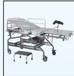
Stainless Steel MNM-GR-503