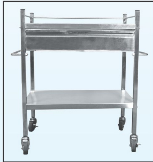
Ward Trolley MNM-PR-435